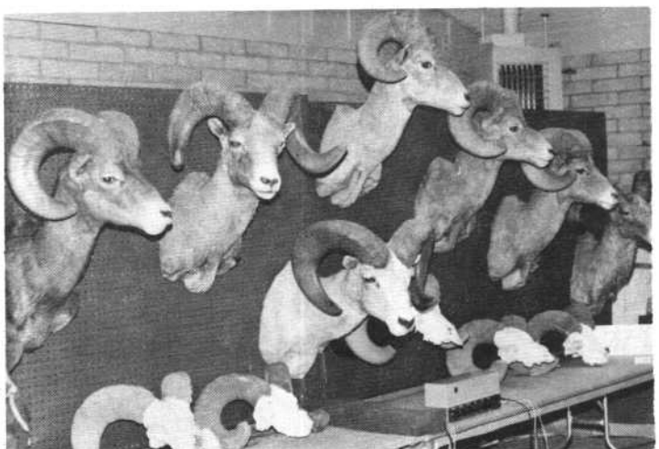
Close-up of part of our last years display.