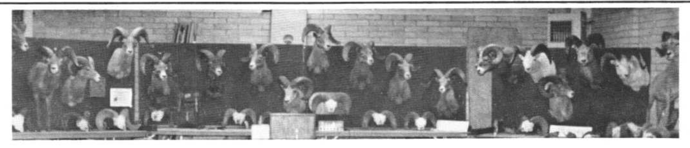
Trophy head display at the 1973 Sheep Hunters clinic. This probably was the biggest collection ever displayed.