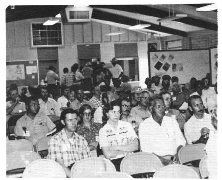
Overall view of 1973 Sheep Hunters Clinic audience.