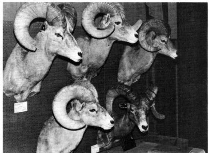
Here are a few of the trophy heads displayed at the banquet.

All proceeds derived from publication will be used by the Society for its transplant work. We'll keep you advised of progress and how you can order your copy.