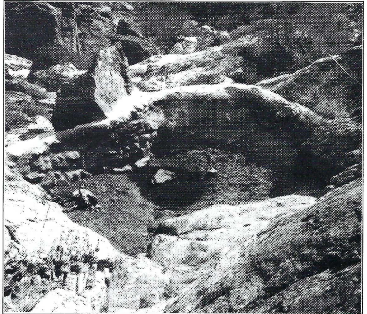
Original Dam — Note Sheep Carcass in Dry Waterhole

Several sheep were observed by some of the members.