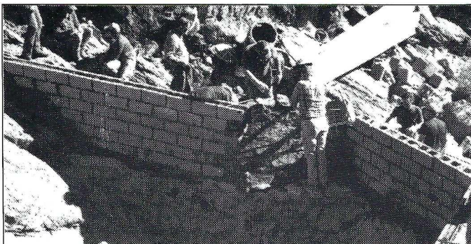
Dam under construction.

Once again, thanks to everyone who participated.