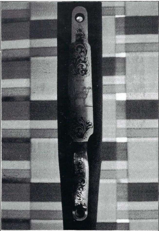
Engraved Floor Plate and Trigger Guard