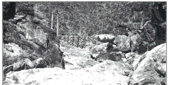
Silt control gabion.